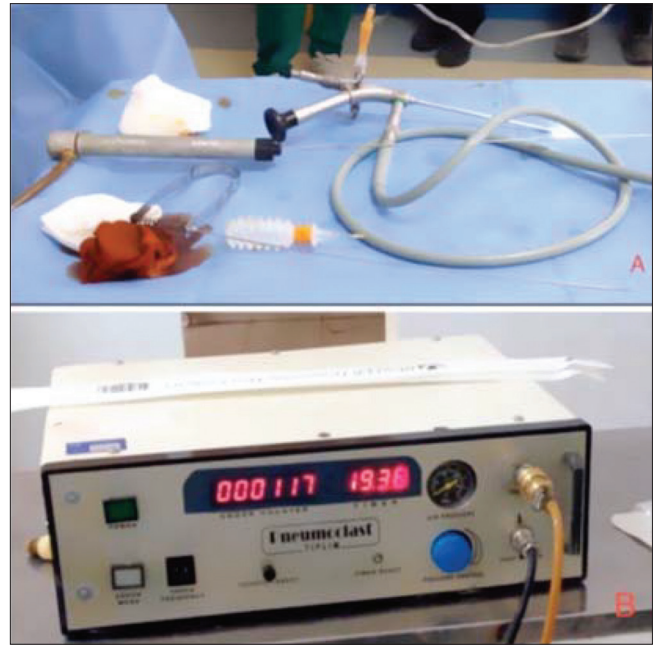
Fig 1. Pneumatic lithotripter and rigid endoscope (A), lithotripter unit (B) Şekil 1. Pnömatik litotriptör ve rigid endoskop (A), litotriptör ünitesi (B)

In this preliminary case report, use of minimally invasive cystoscopic pneumatic lithotripsy method in the treatment