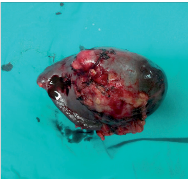
Figure 2. Off-white/yellow-colored cystic lesion in the spleen.

The dimensions of the spleen were 18x11x9 cm. The integrity of the splenic capsule was disrupted, and there was an off-white/yellow-colored cystic lesion that measured 7x6x6 cm (Figure 2). By microscopy, a calcified cystic lesion with a germinal membrane and cuticle was observed in the splenic parenchyma, and numerous scolexes were present in the cyst.