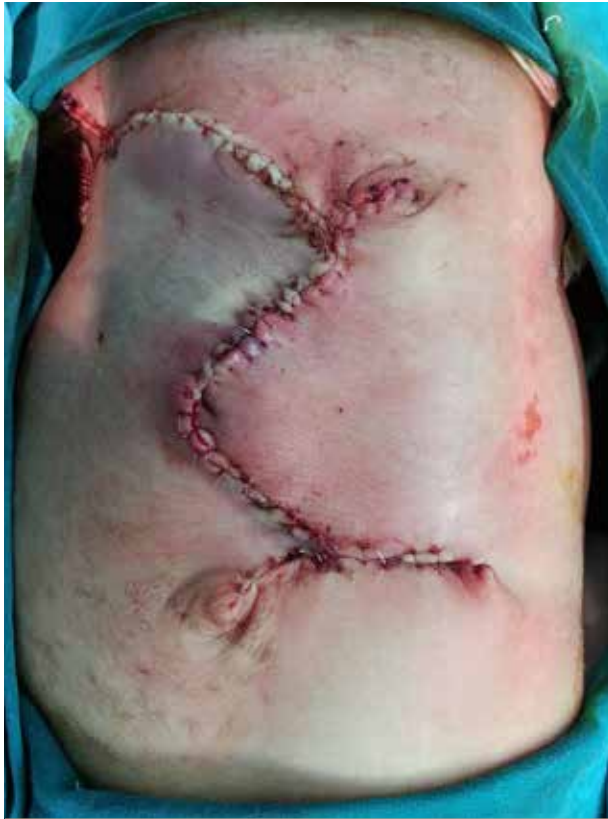
Figure 4. View of the repaired defect at the end of the procedure (although tips of the flaps would be whitened at the end of the procedure, there was no problem during wound healing)