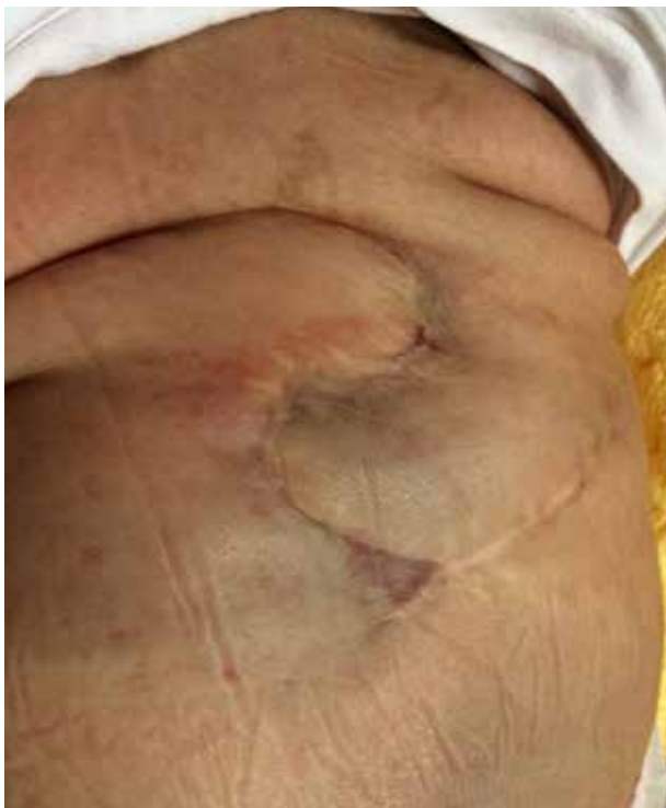
Figure 5. Long-term result of the same patient (2 years after surgery)