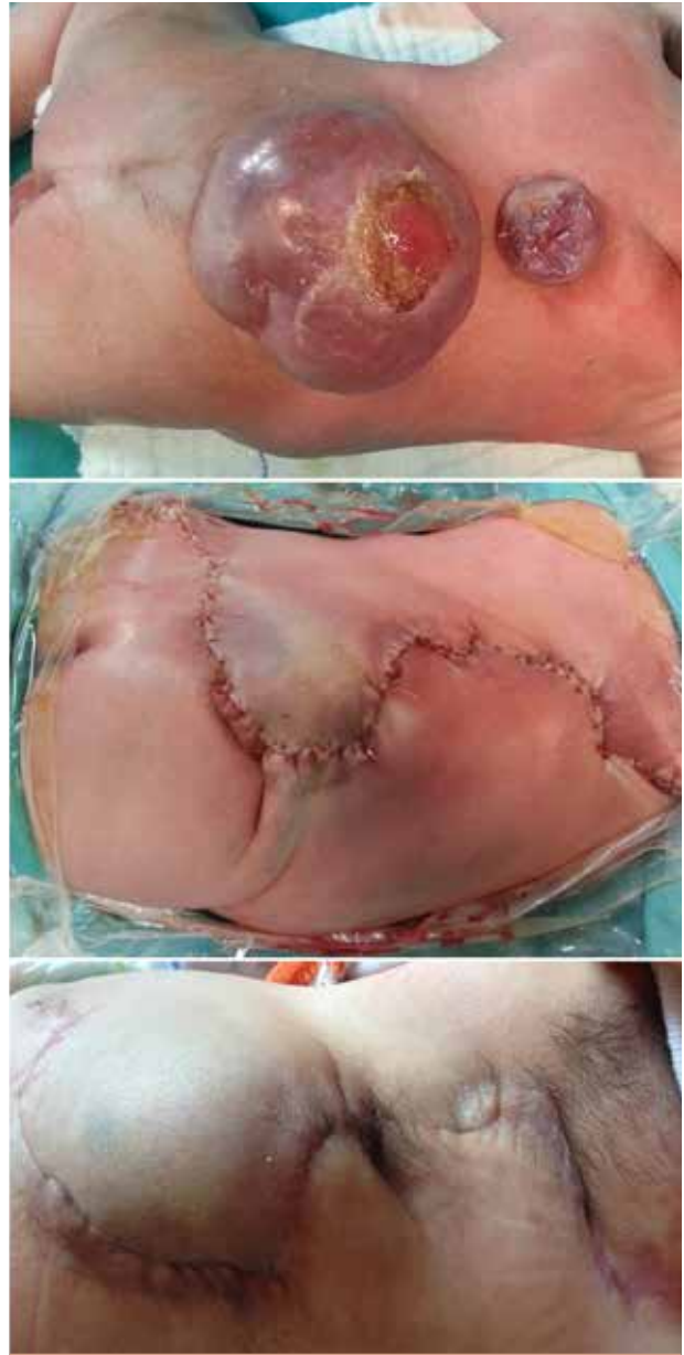
Figure 6. Photographs of the double-level myelomeningocele. Pre-operative view (a), just after the reconstruction was performed (b), and the post-operative 1-year result (c)