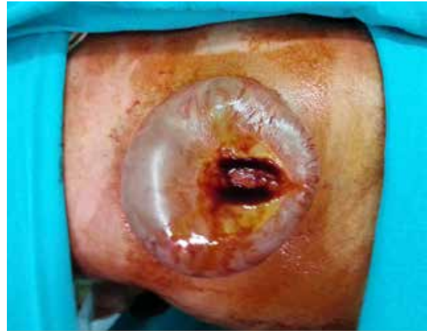
Figure 1. Operative position of the lumbar myelomeningocele

The mean operation time for soft tissue reconstruction was 50 minutes and ranged from 35 to 85 minutes. Intraoperative or postoperative transfusion was not required. The postoperative follow-up period was between eight days