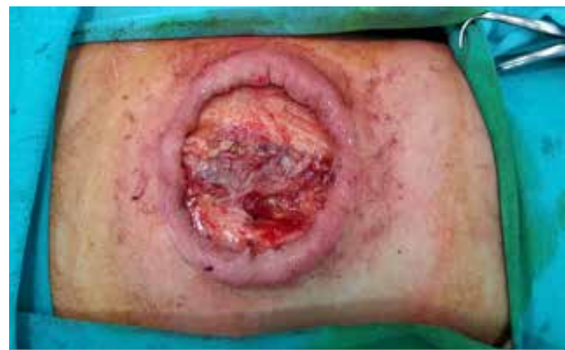
Figure 2. The defect after dural repair