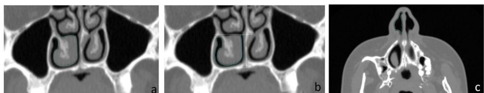
Fig. 2 Green lines demonstrate boundaries of the inferior nasal concha ( a ), meatus nasi inferior ( b ), and nostril ( c ) on the right side determined by the planimetry method on 3D-Doctor Program

A line parallel to the floor of the nasal cavity and perpendicular to the nasal septum and sagittal plane was drawn at the highest level of the superior border of the INC. The